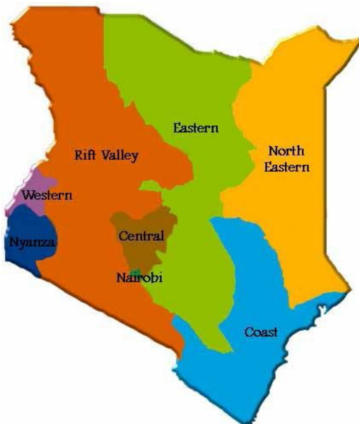
Figure 1: Map of Kenya showing the Provincial Administrative boundaries

About 80 percent of the landmass, particularly in the northern and north eastern parts of the country as well as those areas in the southern part of the Rift Valley province is arid and semi